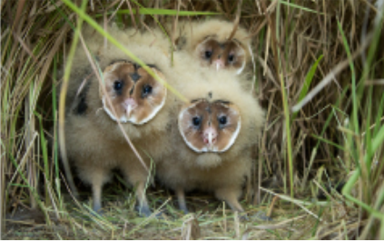
The city's green veins Two Witsies are doing what they can to preserve and share our natural environment