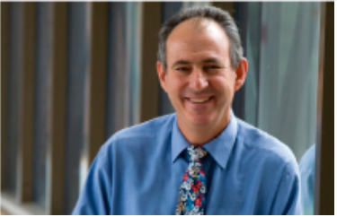
Diabetes at 212°: a call for action About 415m people worldwide have diabetes – and almost half don't know they have it.