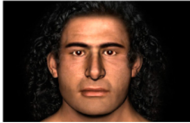
The face of Ancient Greece Wits links the past and present again, giving an identity to the dead