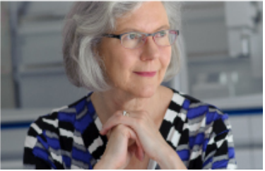
Pushing back suffering Medical alumni continue to advance frontiers