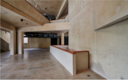
Origins Centre new wing A new space opens for Wits treasures