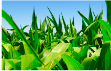
Fresh look at biofuels Engineers cut out an unnecessary step